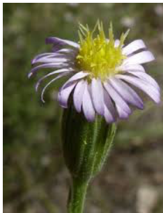
Vittadinia muelleri ,

“Unfortunately people have been walking through or letting their dogs run through and the possums have discovered the geraniums are tasty. The plants that have appeared are Vittadinia muelleri , Linum marginale , Geranium retrosum and a bit of Leucochrysum albicans subsp. tricolour with some other forbs and grasses too.