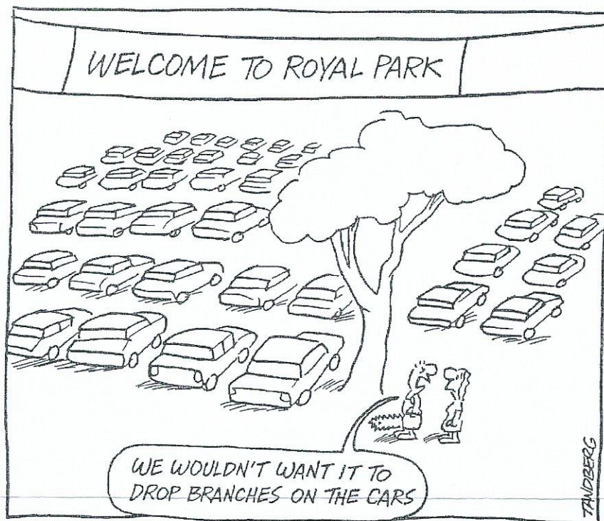
THE ROYAL (CAR) PARK